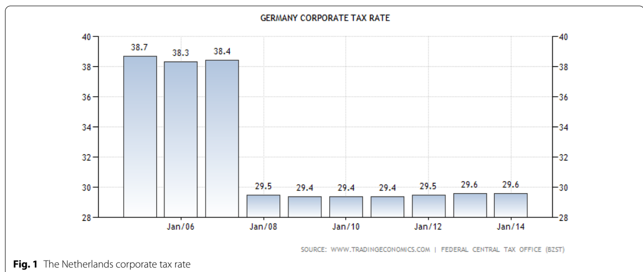
Table 1 and Figs. 1, 2, 3 show the average book income before tax and taxable income of Dutch and German listed companies from 2002 to 2009. The results show significant discrepancies if comparing these two European countries with the USA [9, 12, 18]. Managers have