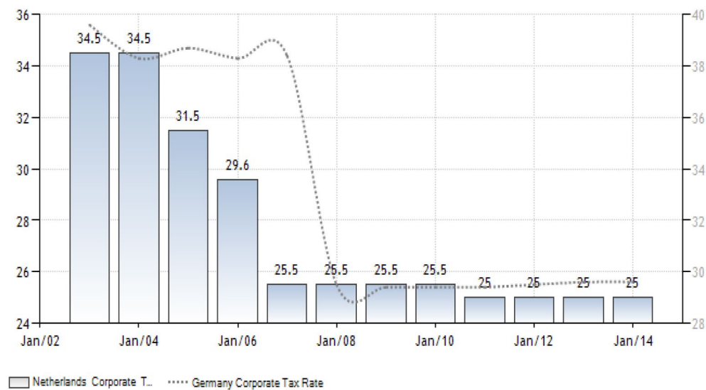
Fig. 3 The Netherlands and German corporate tax rate

to report as much of expenses opposite as little revenues as they can in attempting to maximize tax saving in financial statements, but the tax authorities do not unlimitedly allow them to secure tax revenue in the governmental department. In this case, it can be expected that taxable income will be greater than book income. Moreover, the discrepancy between two incomes is exceedingly unchanged except for 2009. Table 1 illustrates no