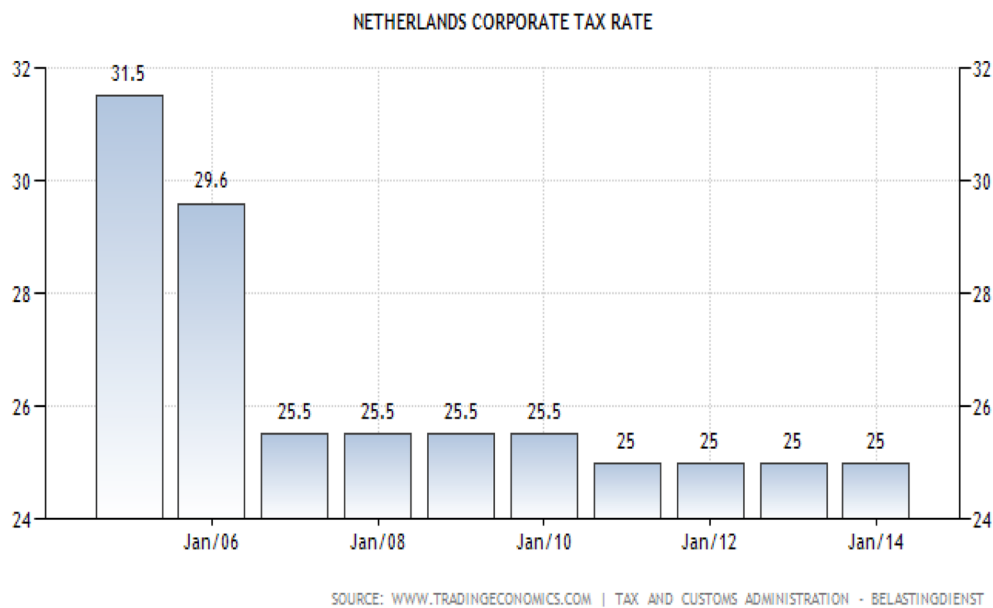
Fig. 2 German corporate tax rate